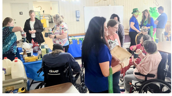
Dr. Seuss Week at Edgewood Manor. Fun for all!