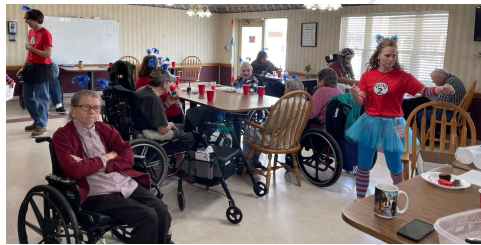
Dr. Seuss Week was Straight Outta Whoville!